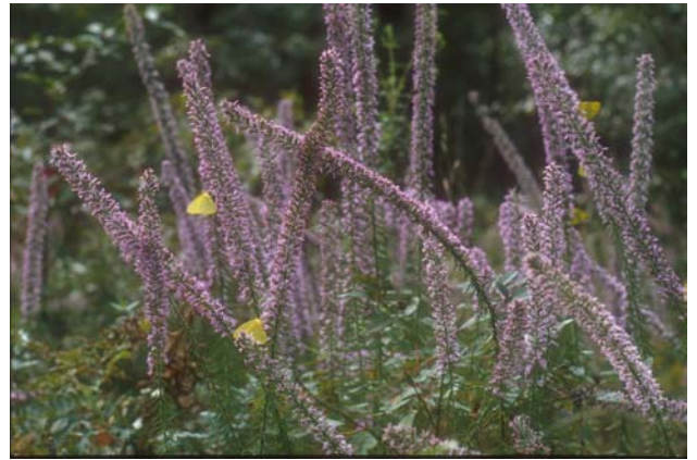
Liatris with Cloudless Sulfur Butterfly