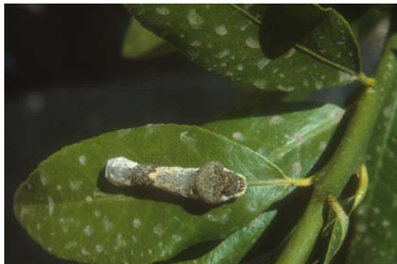
Giant Swallowtail larva