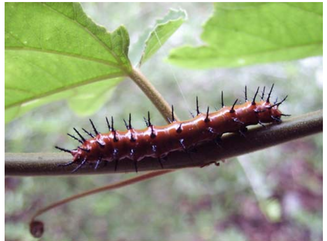
Gulf Fritillary caterpillar