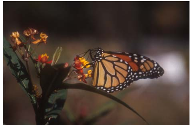
Monarch Butterfly on Asclepias