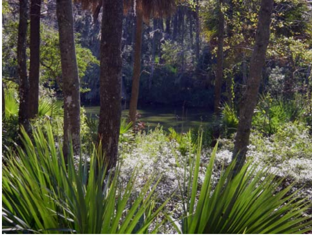
Pond view vista

30' of the pond edge. One pond access path (less than 5' wide) may be established through the filter vegetation at an acute angle to the pond edge.