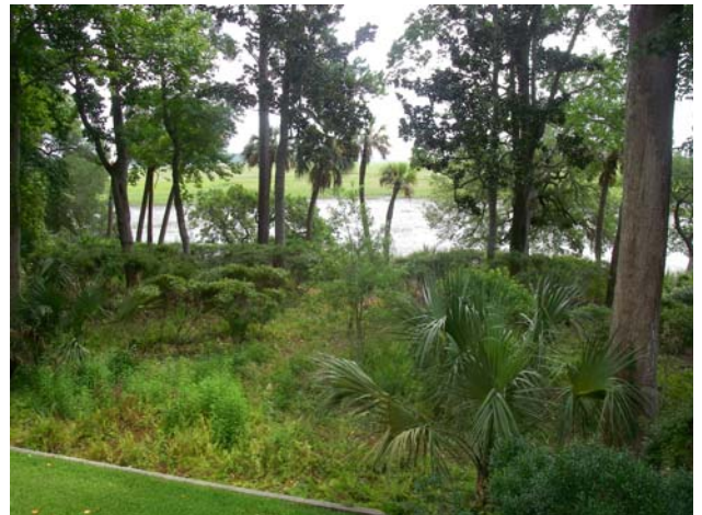
Marsh view vista

shrubs) being retained to break up the view of the home from outside the lot. Pruning in the buffer area (for view vistas) must leave vegetation of varying heights and types (trees, shrubs, aquatic plants etc.) so as not to create a “hedge” appearance. Clear cutting is not allowed. The establishment of new vistas or the removal of trees or shrubs requires approval from the Trust Landscape Ecologist as the landscaping representative of the HRB.