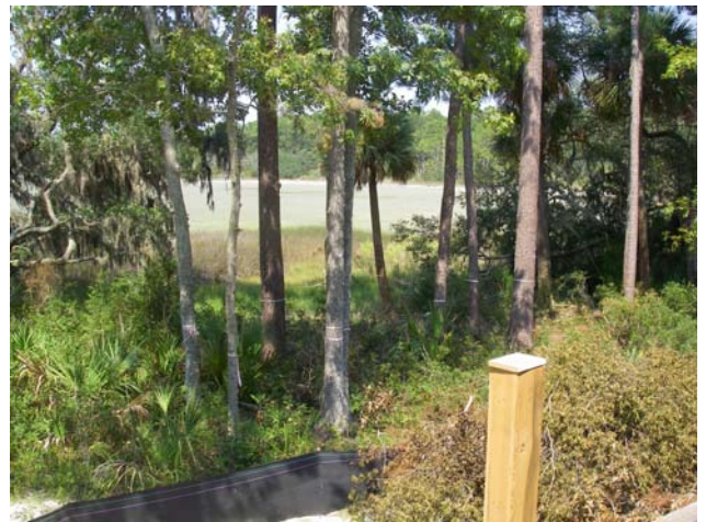
Marsh view vista established at framing.

Pruning in this natural area shall not result in a "hedge" appearance, but have varying heights of vegetation. Pathways from the home to the course should be located along a shared property boundary so that the view down the path from the course is into the side Nature Curtain.