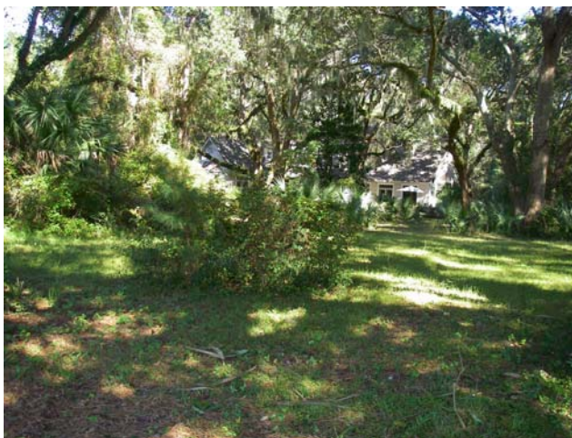
View from golf course.